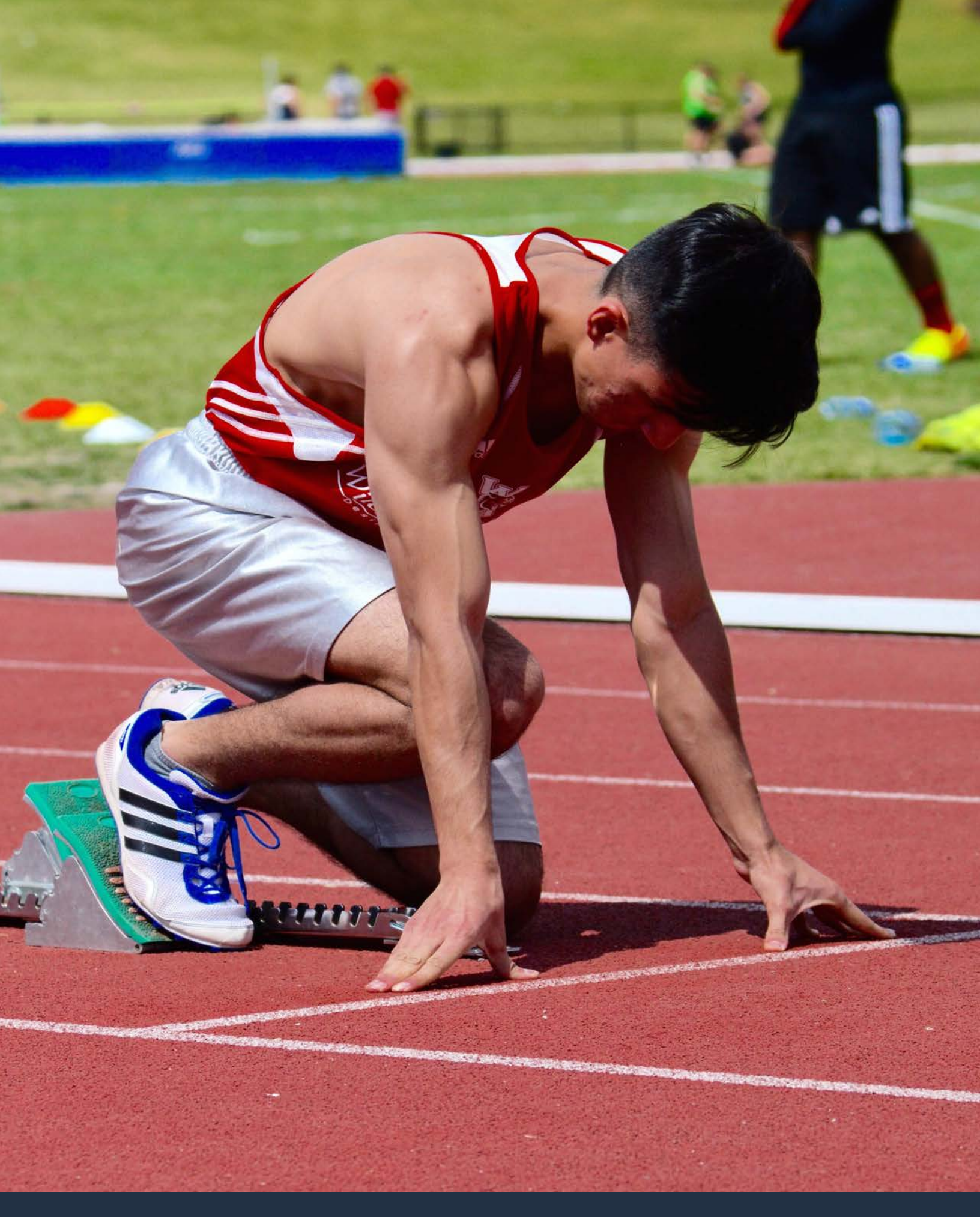
Senior school track athlete participating in the C.I.S.A.A. Track and Field Championships