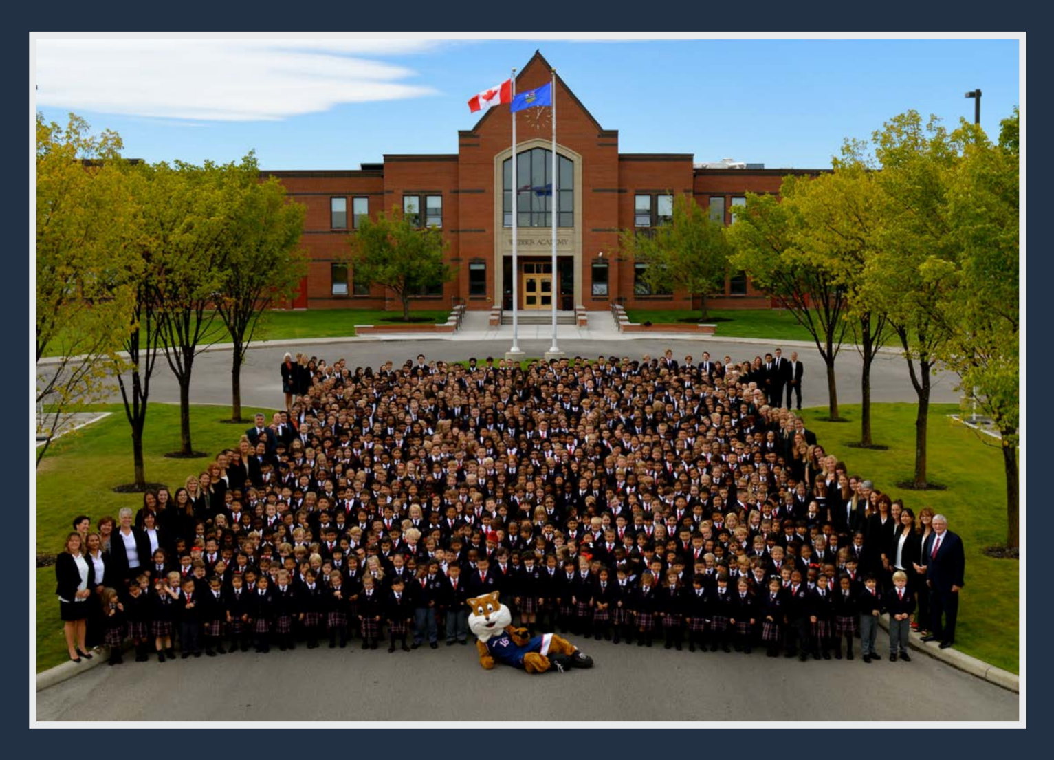
"Preparing students to thrive in university and beyond"