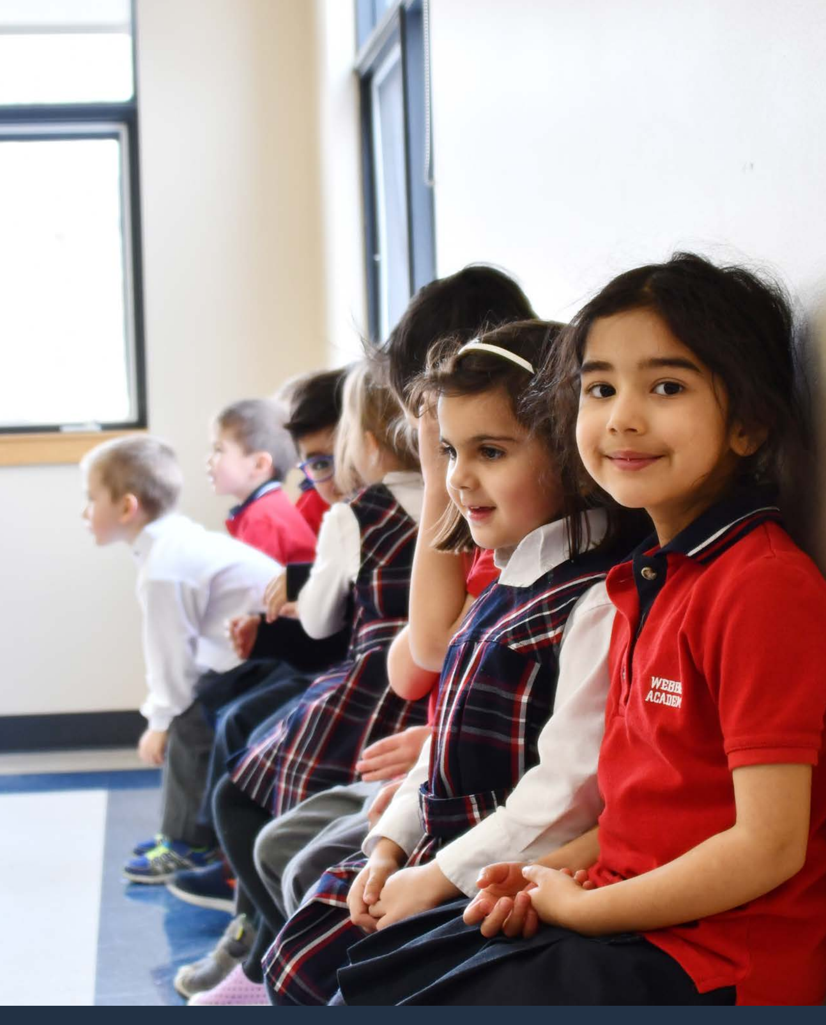
Kindergarten students in the Kindercentre gymnasium