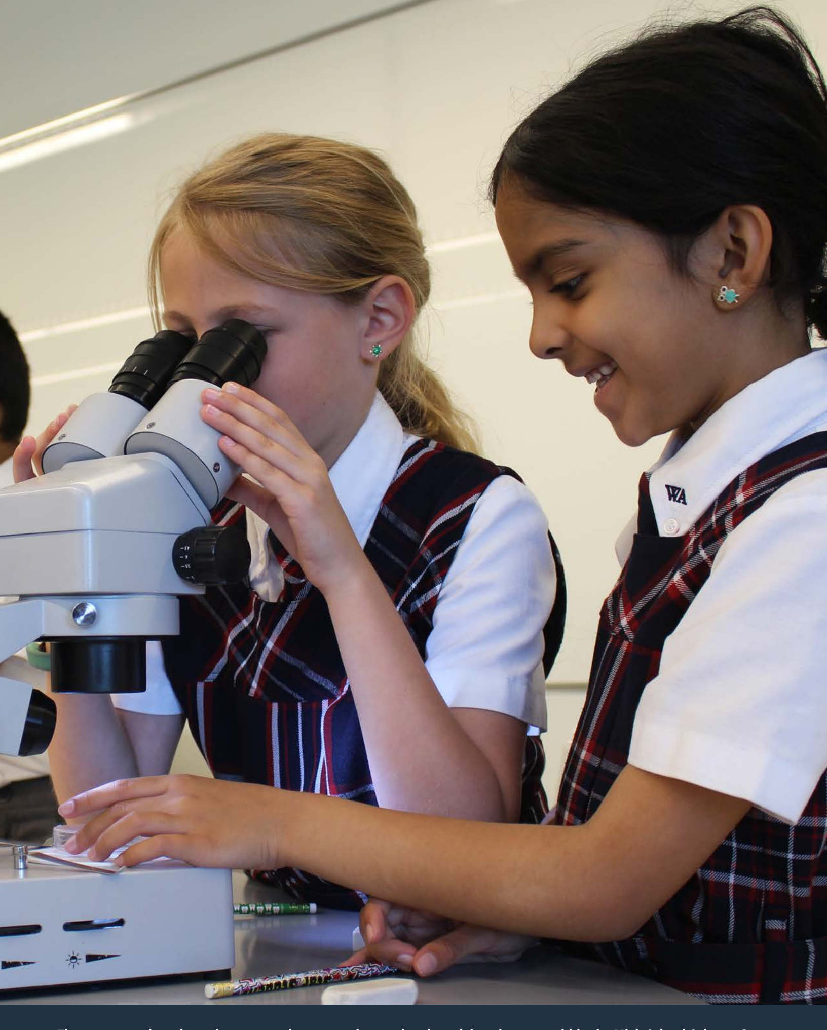
Elementary students have the opportunity to experience a hands-on lab assignment within the High School Science Centre