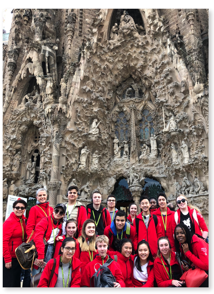
Webber Academy students on a Spanish language immersion trip to Spain.

Occasionally, excursions are planned outside of Calgary which are designed to enhance various programmes. These excursions are optional, and costs for such excursions vary according to the programme. The cost for these excursions is not included in the school fees.