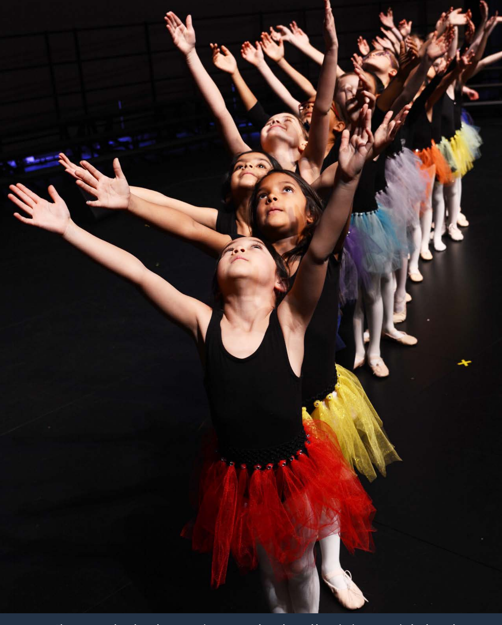
Elementary students have the opportunity to express themselves and be active in extra-curricular dance classes