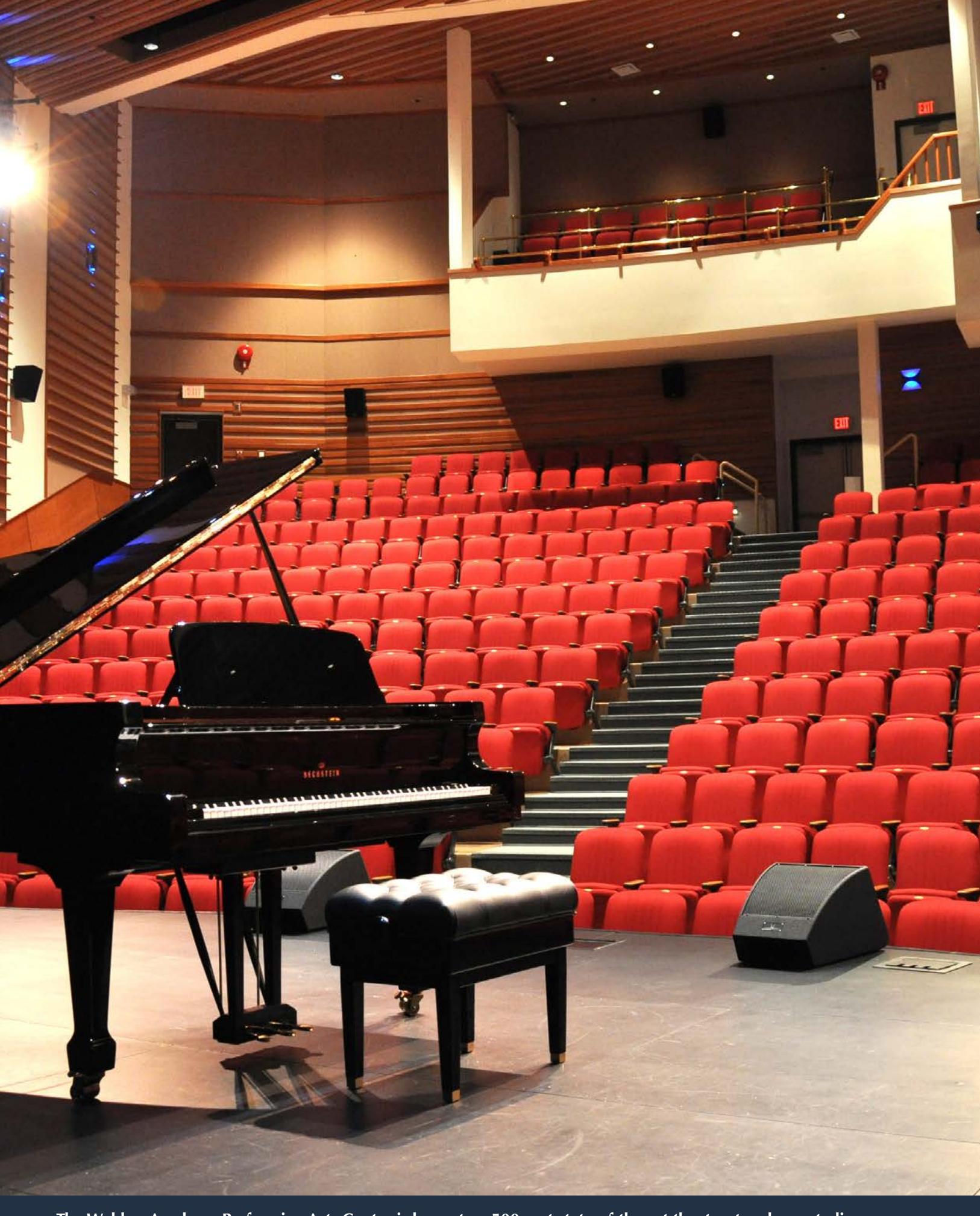
The Webber Academy Performing Arts Centre is home to a 500 seat state-of-the-art theatre, two large studio performance rooms, and a spacious lobby