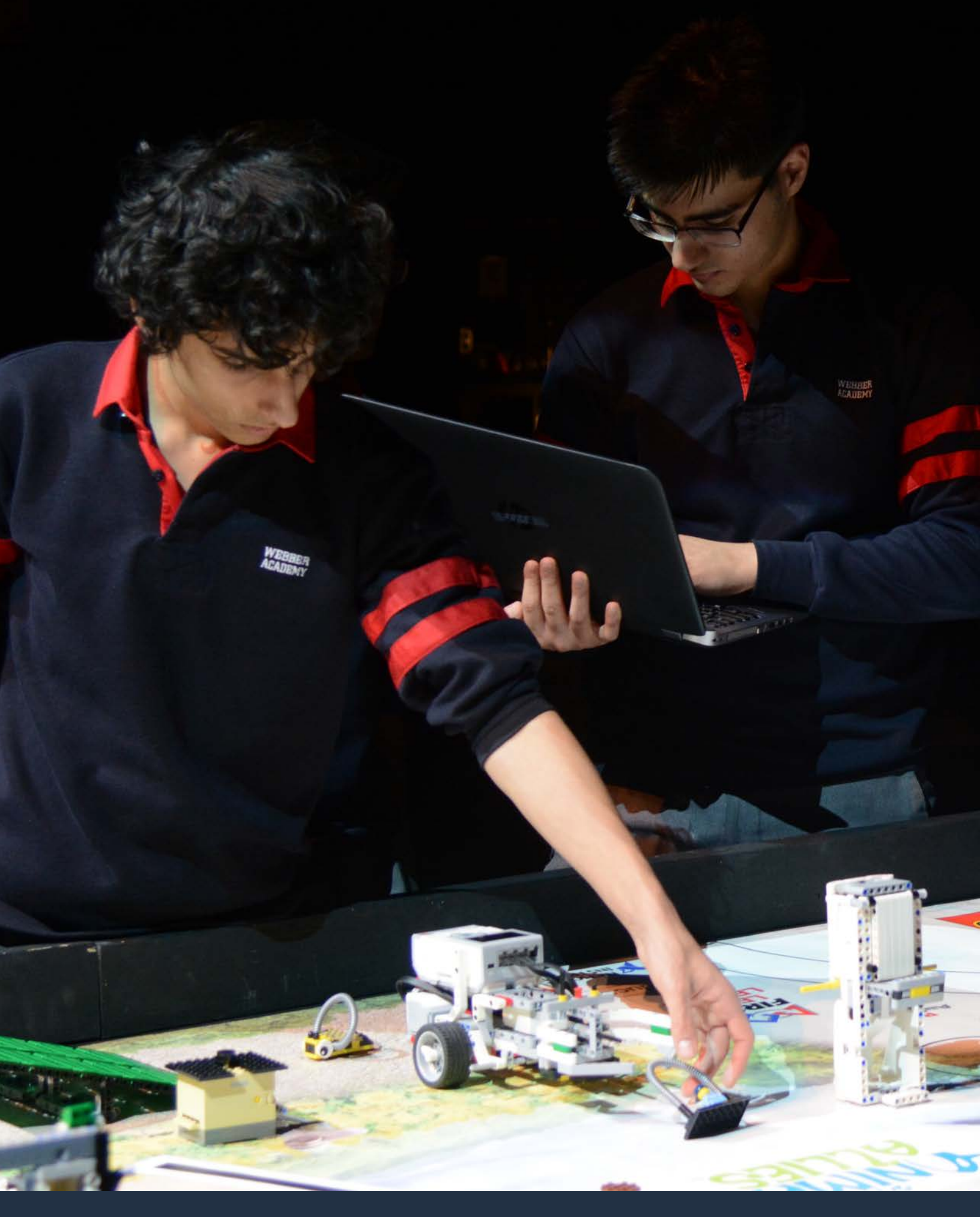
Senior High Robotics Club in a competition at Webber Academy